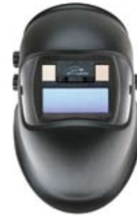
Part No. K533- Black, unpainted, selectable shade 10 or 11