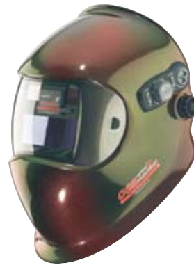
Part No. K604- Cosmic Copper