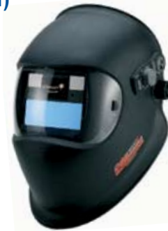
Part No. K570