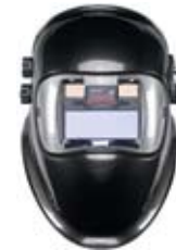
Part No. K600- Charcoal