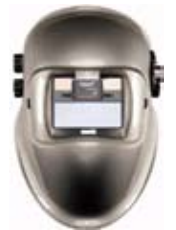
Part No. K602- Silver