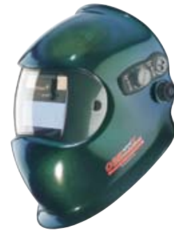
Part No. K575