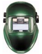
Part No. K603- Green