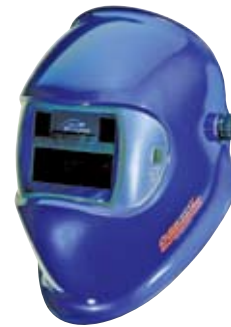
Part No. K532- OSE Blue