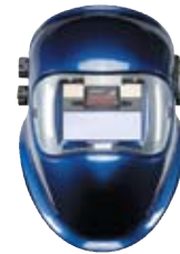
Part No. K601- Blue