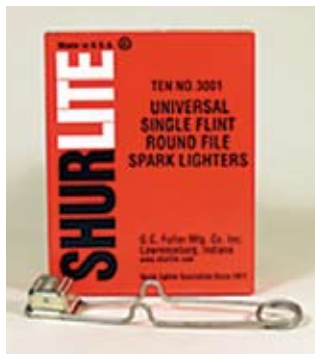
Part No. 3001