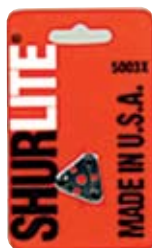
Part No. 5003X