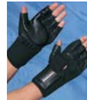
Part No. 0440