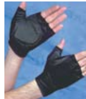
Part No. 0430