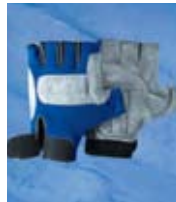
Part No. 0424