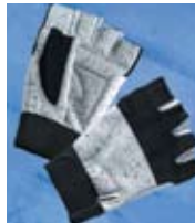
Part No. 0423