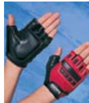
Part No. 0425