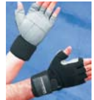
Part No. 0443