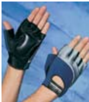
Part No. 0422