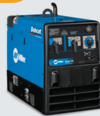
Welder/Generator 907500001 $4,805 MSP