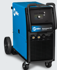
TIG/Stick Welder 907596 (without spool gun) $2,645 MSP