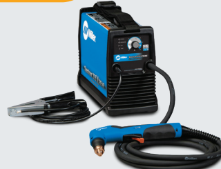
Plasma Cutter 907529 $1,495 MSP