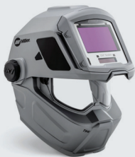
260483 $535 MSP