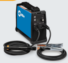
TIG/Stick Welder 907710 $1,315 MSP