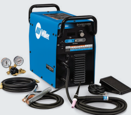
TIG Welder 907627 $2,289 MSP