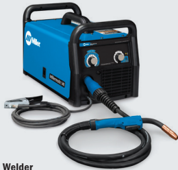
MIG Welder 907612 $875 MSP