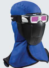
267370 $209 MSP