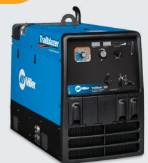
Welder/Generator 907753 $5,961 MSP