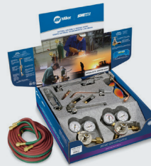
MBA-30510 $529 MSP