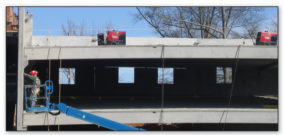
A Ranger® 225 is an excellent choice for a wide variety of projects.

<sup>(5)</sup> Kohler<sup>®</sup> warranty is 3 years.